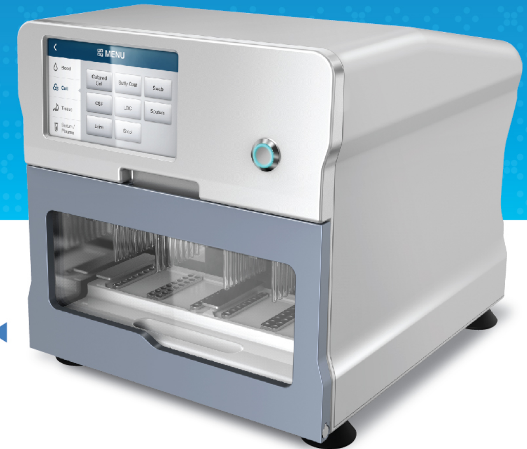
Model : NC-15 PLUS(32/48)